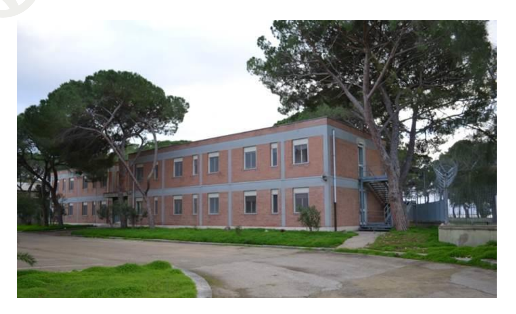
PG110_Officers housing and marshals (F.13, part. 84)