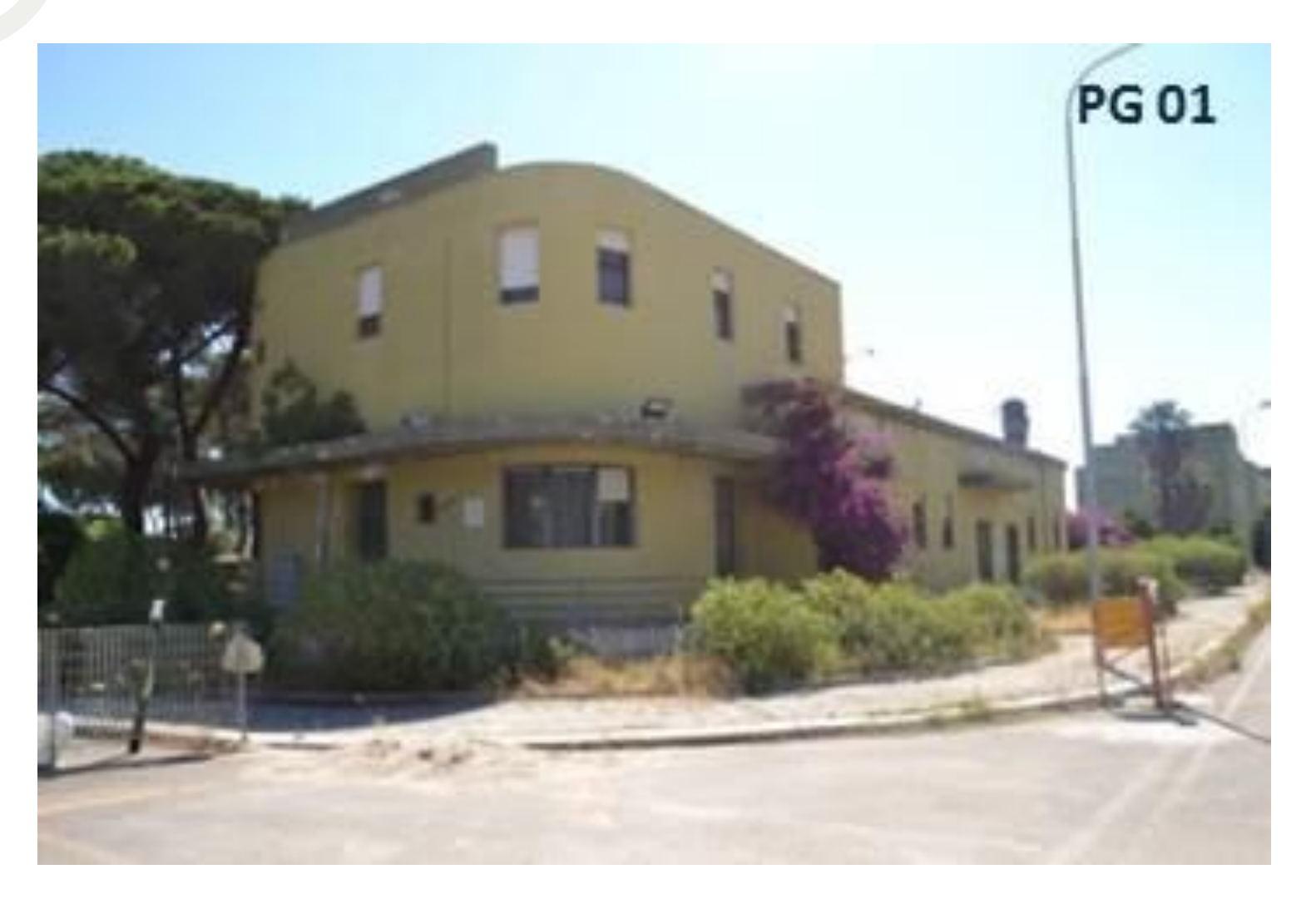
PG01_Guard House (F.13, part. 78)