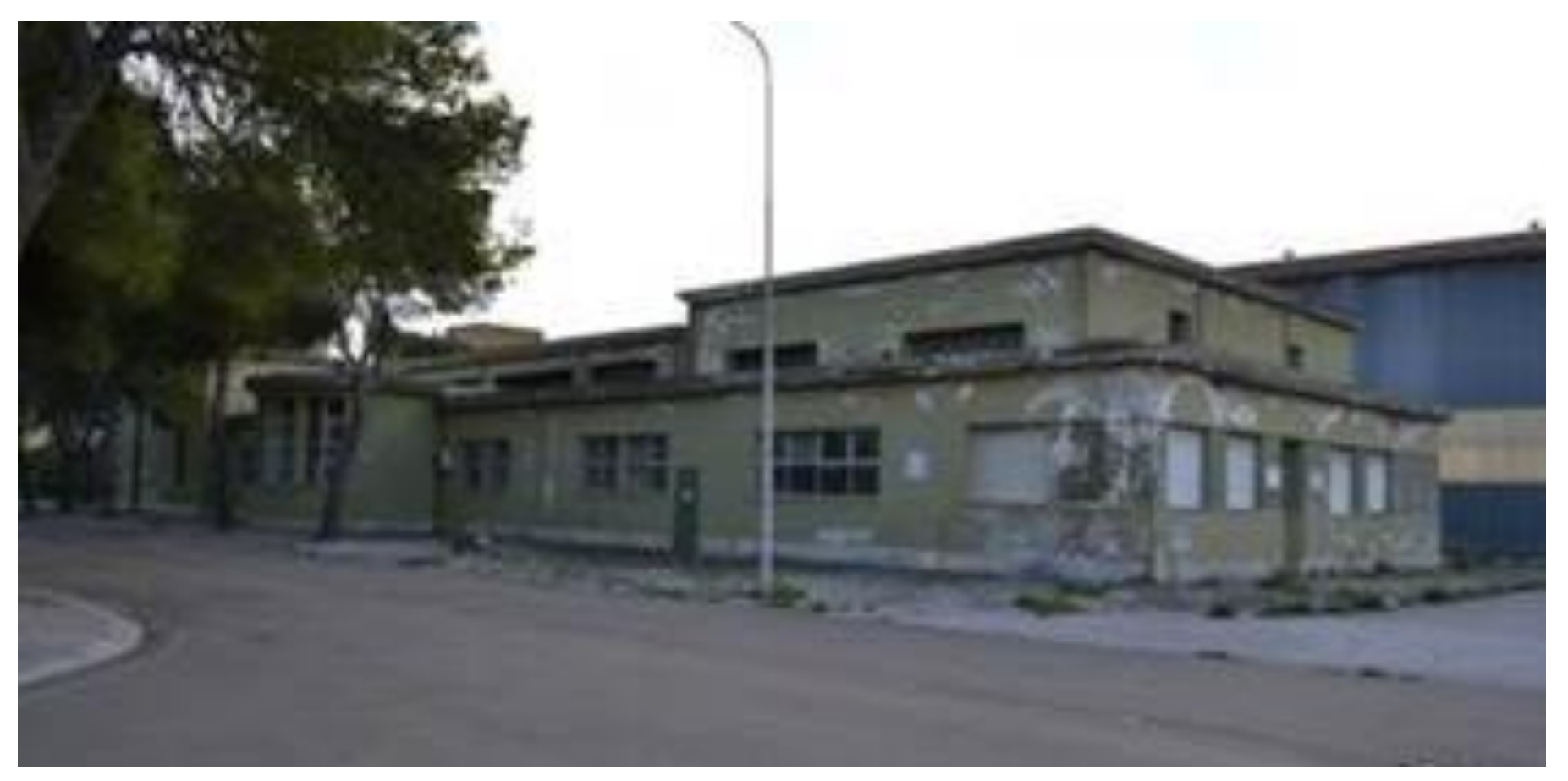
PG13_Airport workshop (F.13, part. 92)