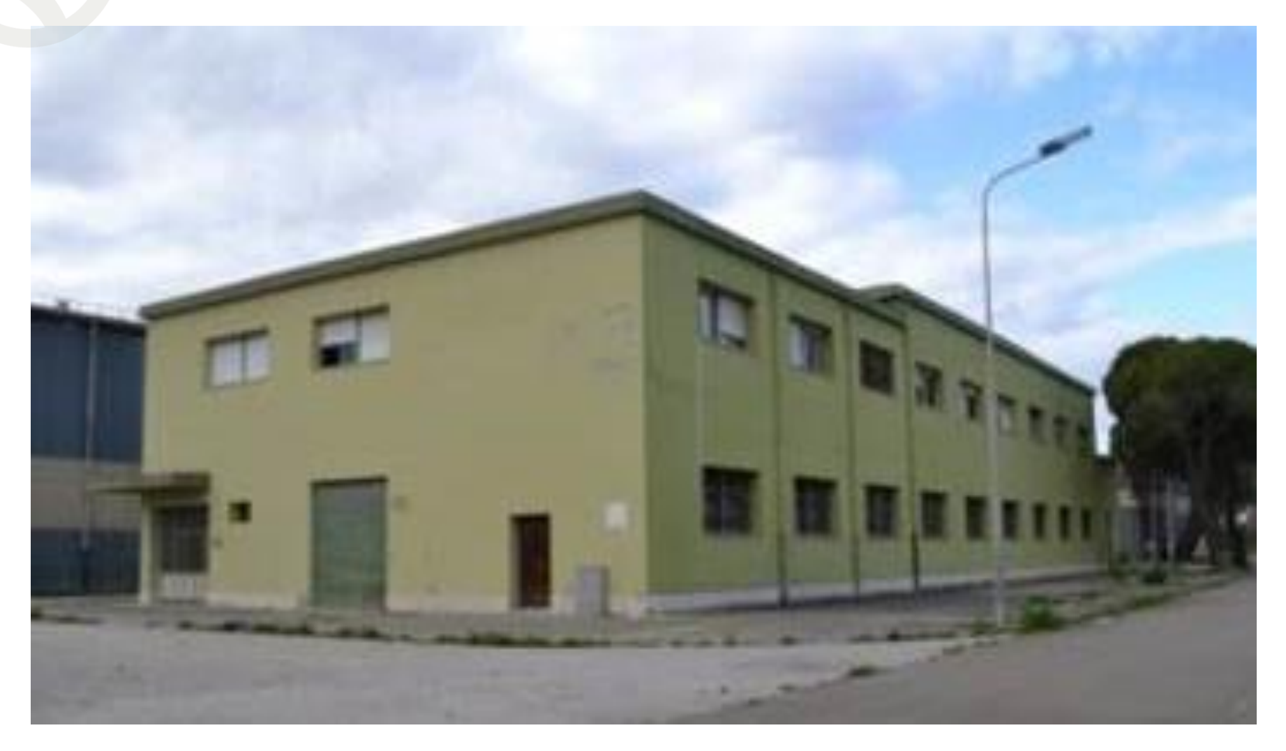
PG11_Warehouse M.S.A. (F.13, part. 91)