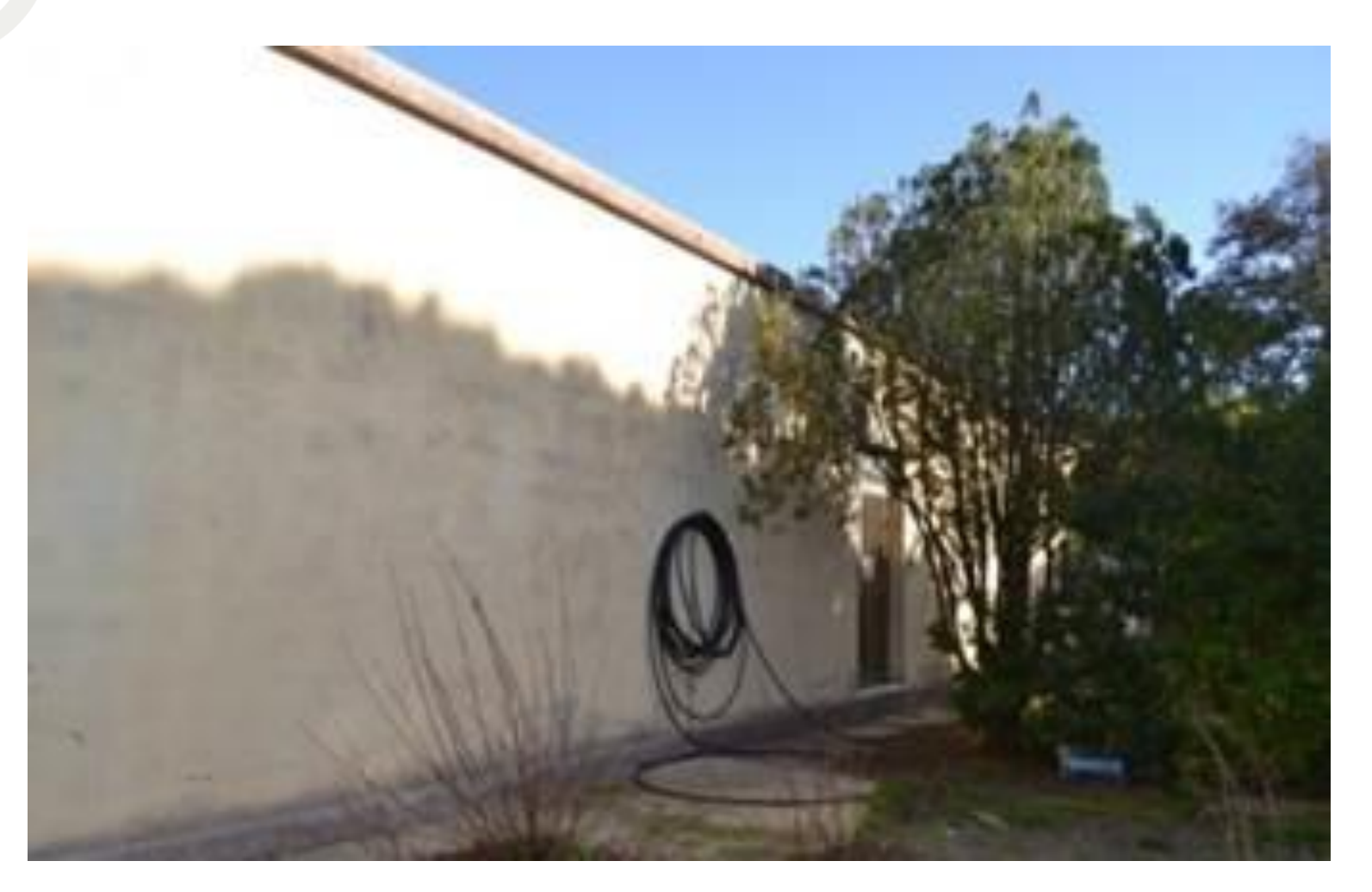
PG117_ Warehouse, minute maintenance of plant services (F.13, part. 77)