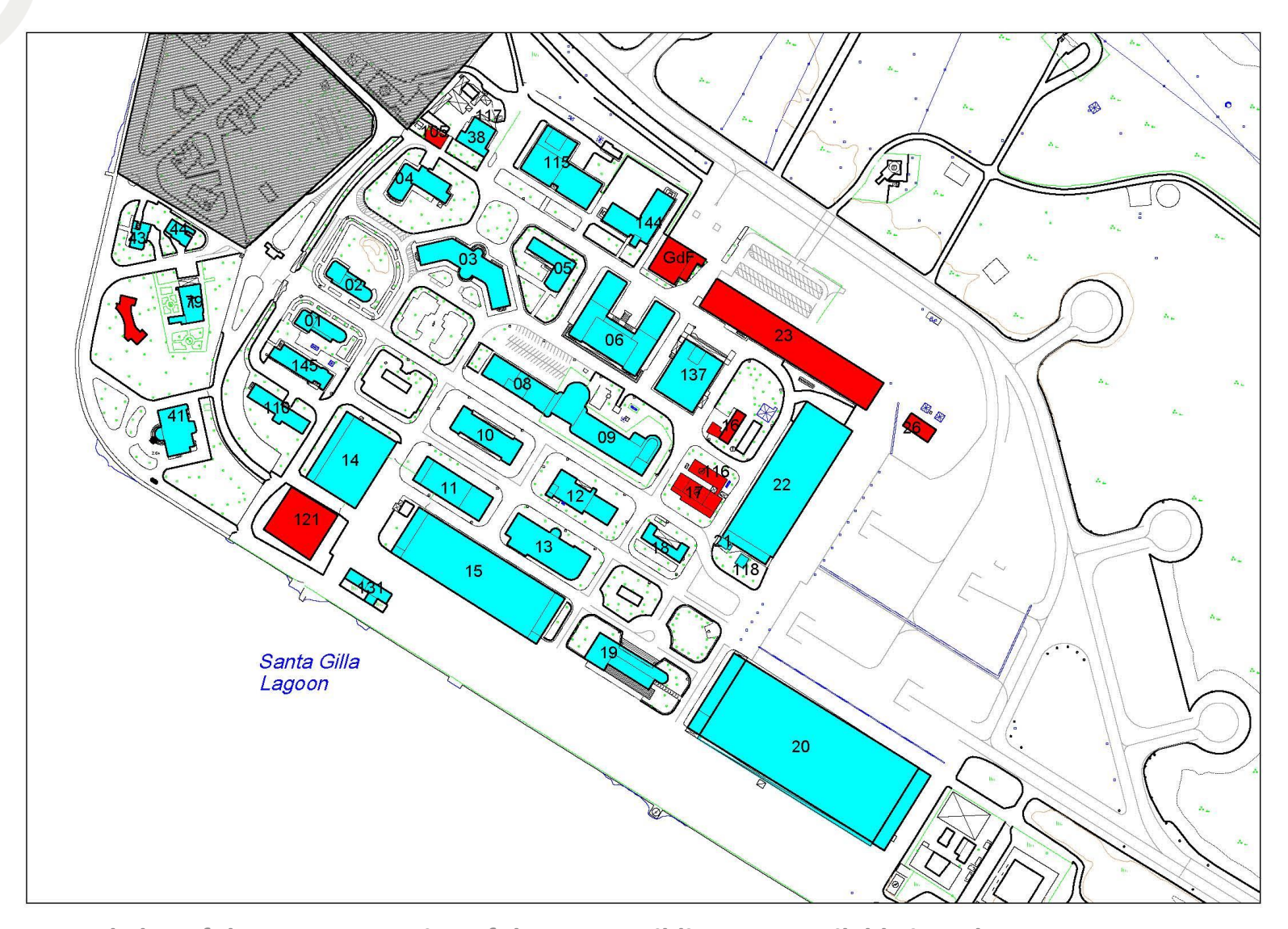
General plan of the western section of the area. Buildings not available in red