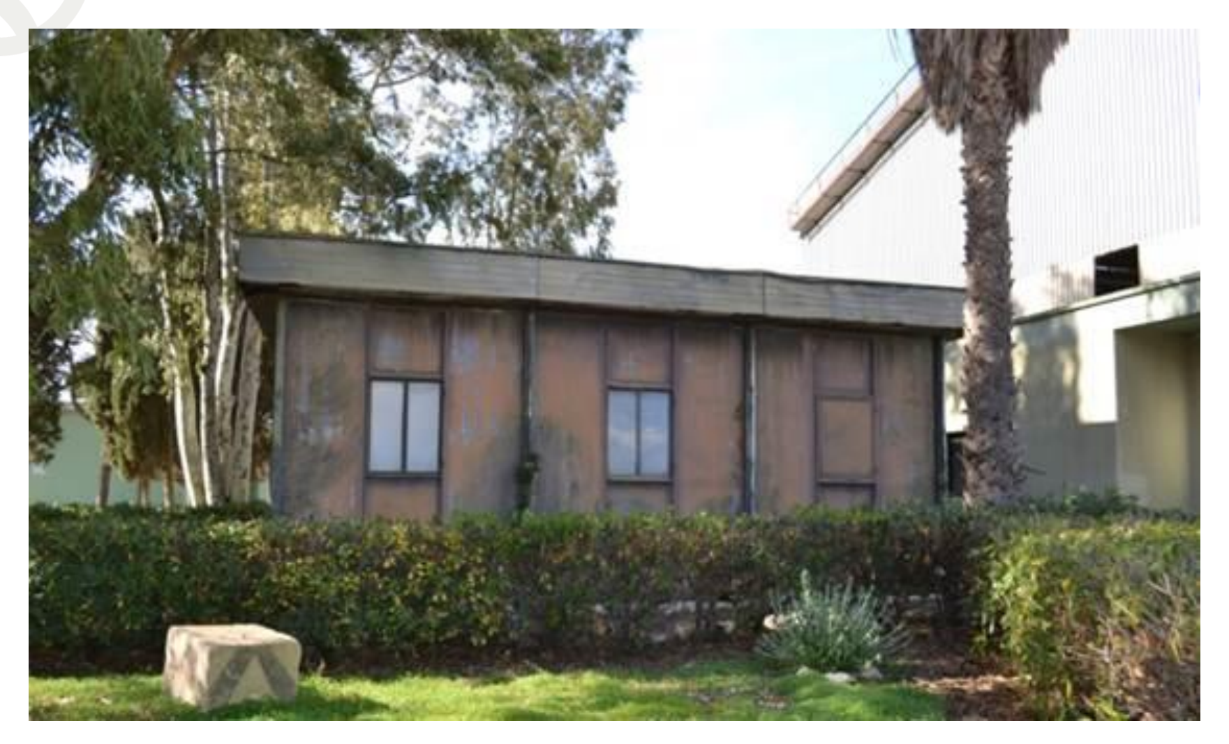
PG118_Prefabricated S.P.E.C.I. (F.13, part. 119)