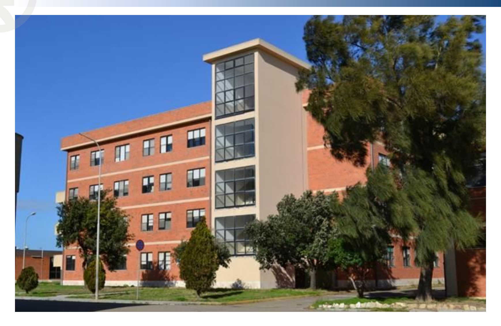
PG144_ New non-commissioned lodgings (F.13, part. 107)