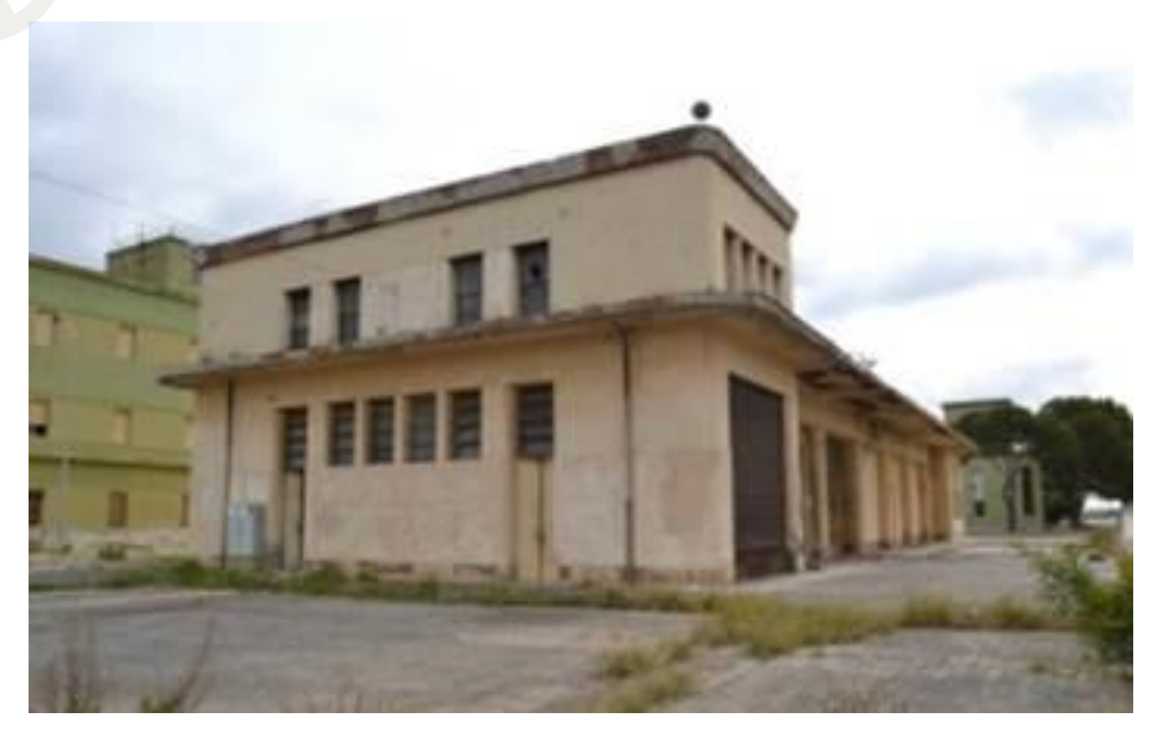
PG 10_Atlantic material warehouse (F. 13, part. 93)