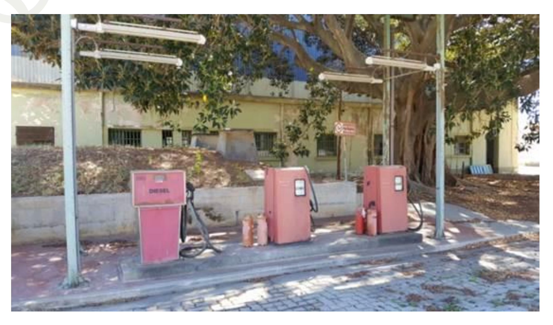
PG40_Car Refuelling Station (NC)