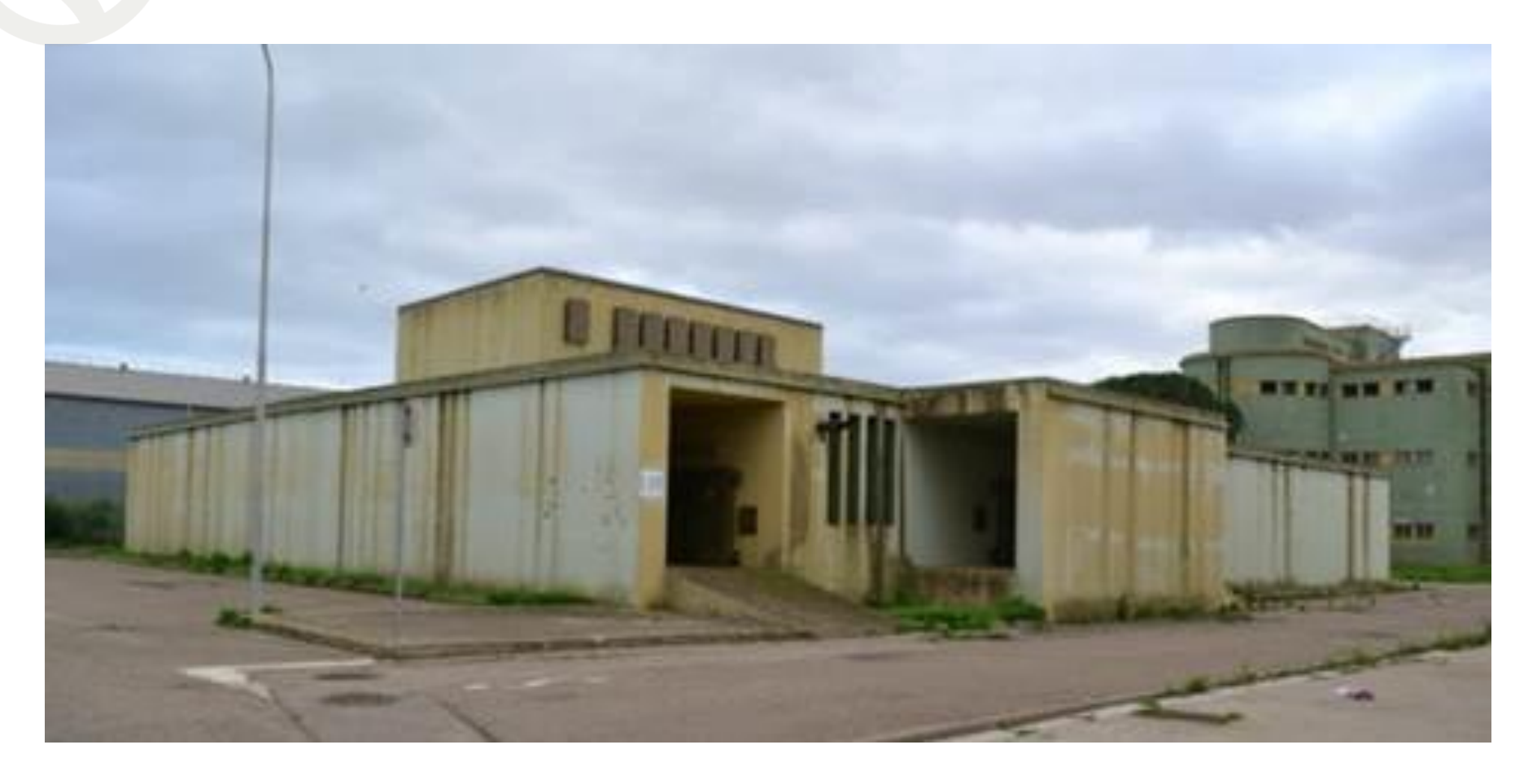
PG137_Bunker S.P.B.F. (F.13, part. 101)