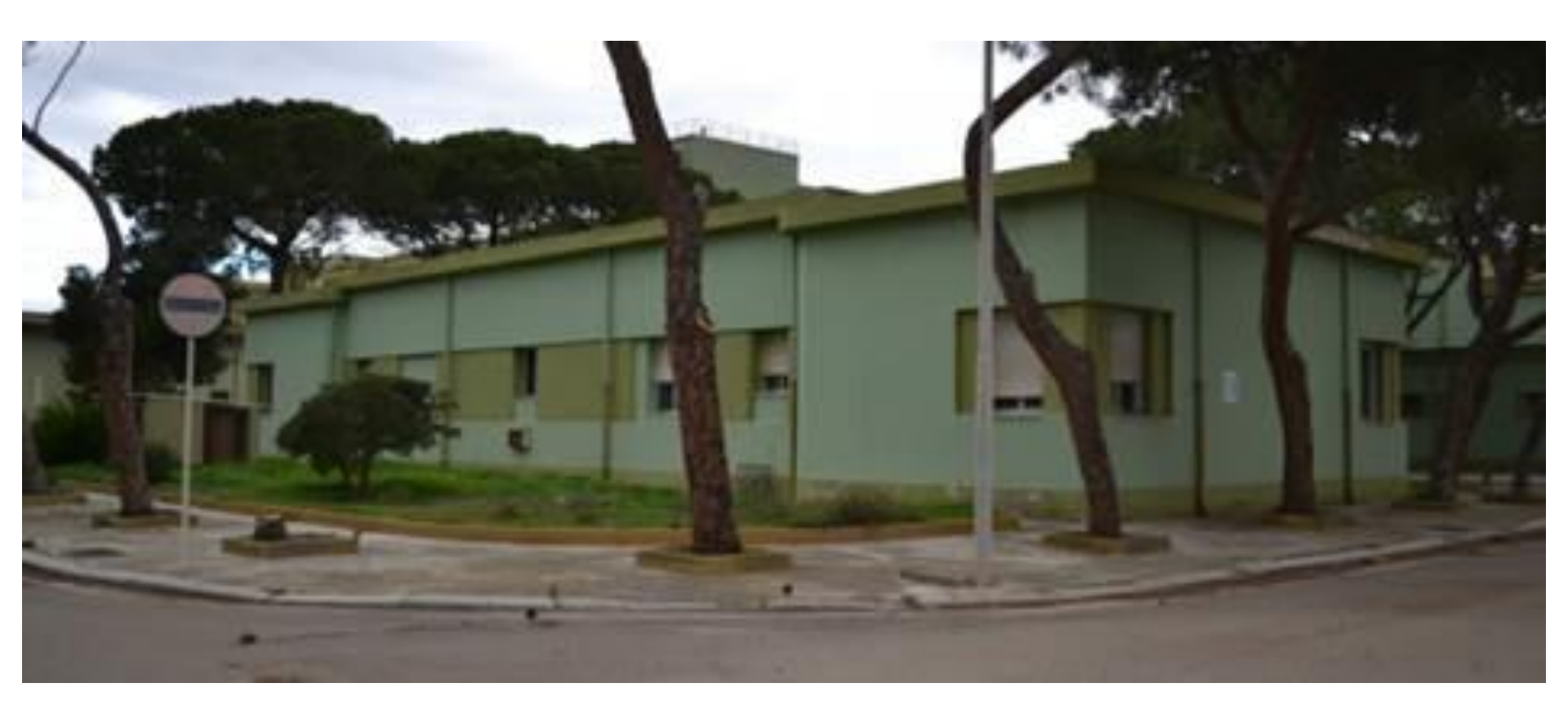
PG18_Photographic laboratory (F.13, part. 104)