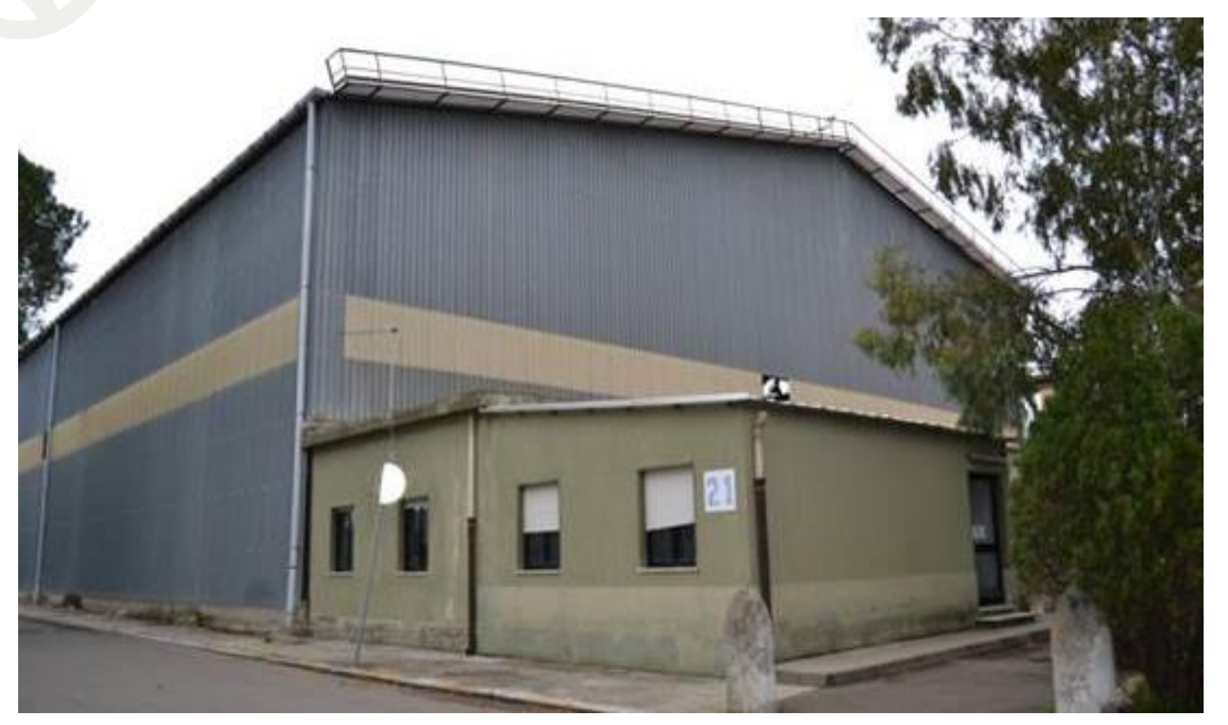
PG21_Hangar S.100 and offices (F.13, part. 118)