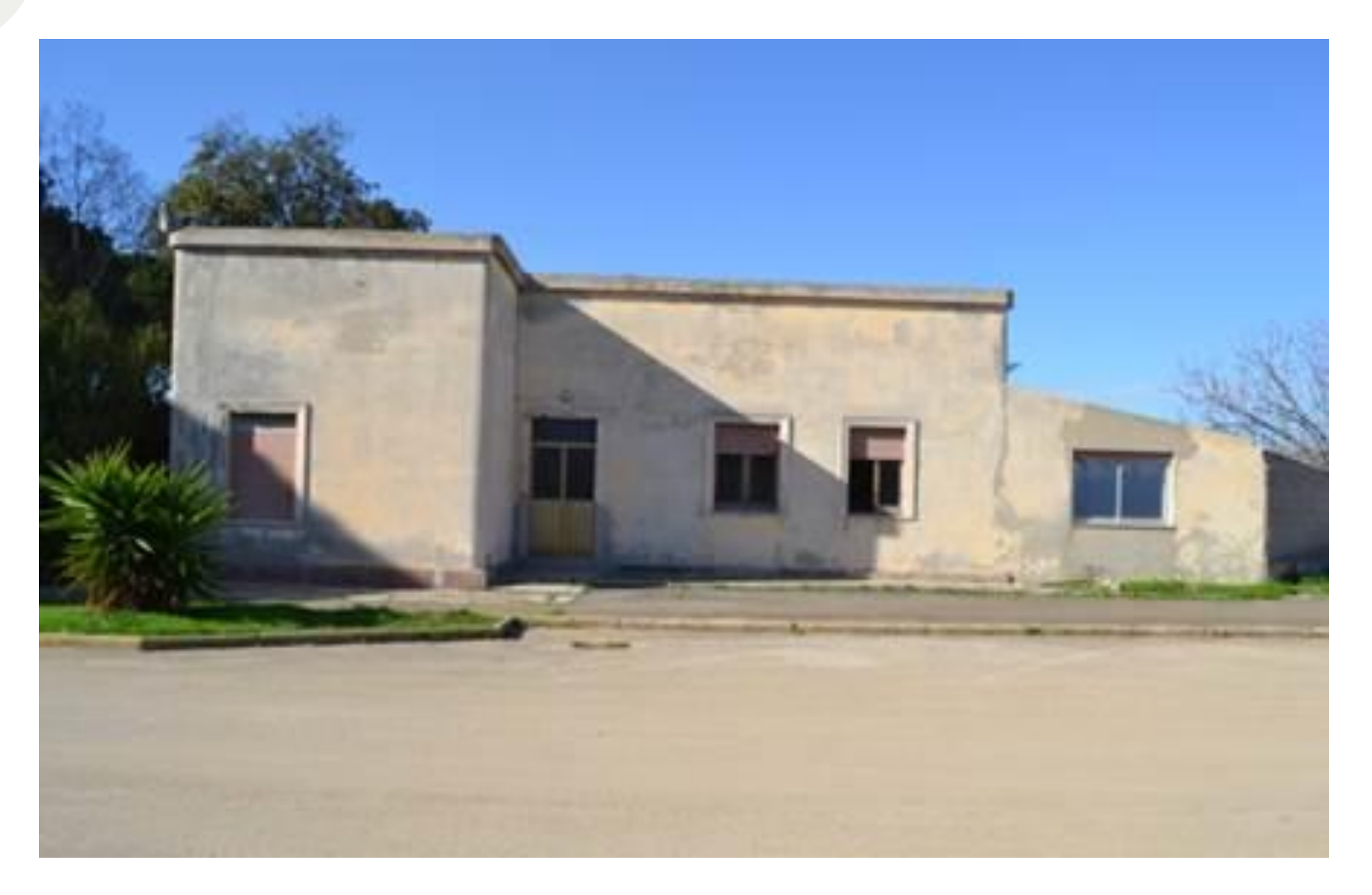
PG38_ Plant service (F.13, part. 77)