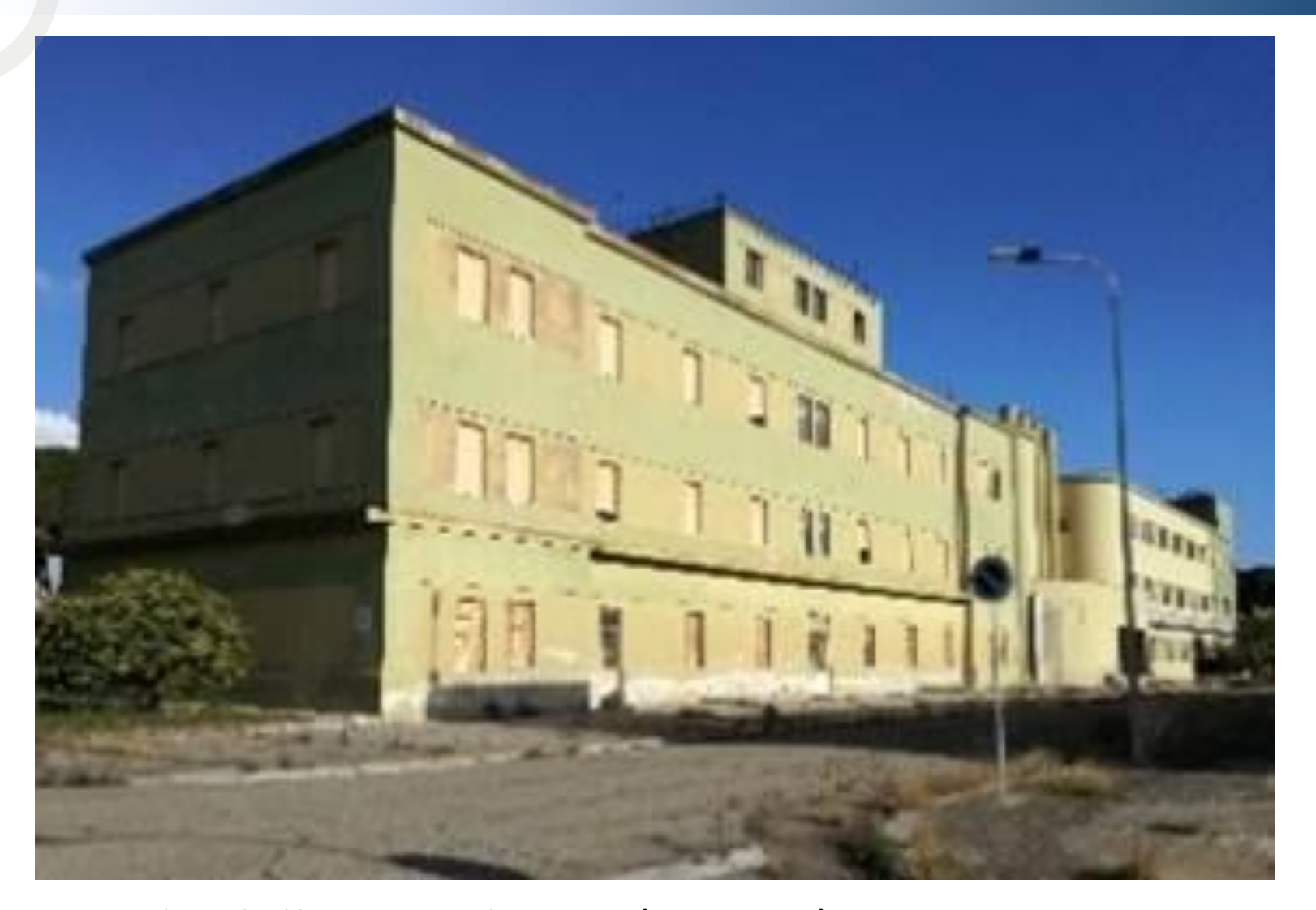
PG08_Substandard housing – warehouse M.O. (F. 13, part. 95) PG09_Airmen barracks (F. 13, part. 96 e 97)