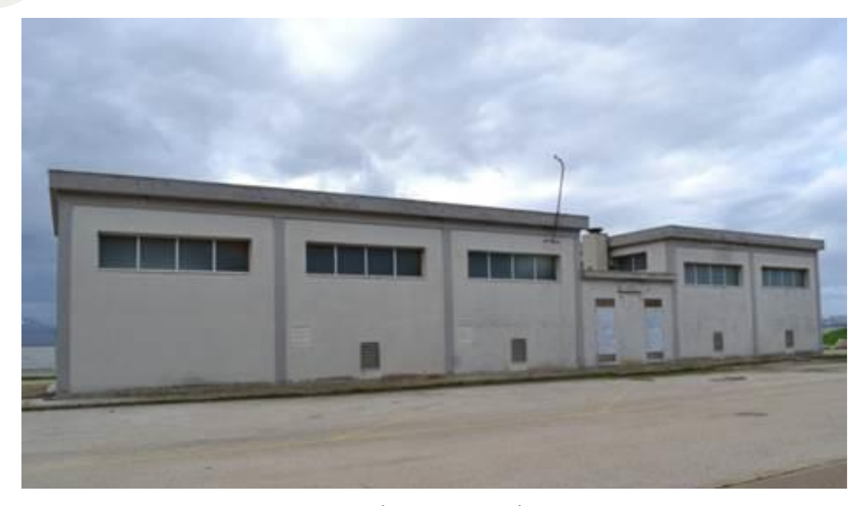
PG131_Painting room for vehicles (F.13, part. 89)