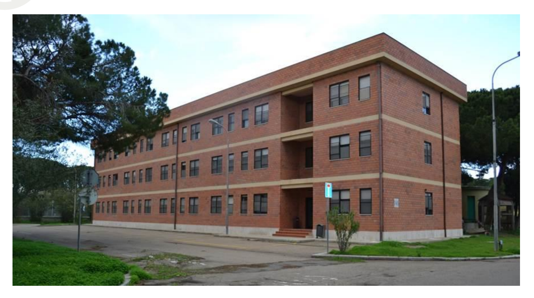
PG145_New officers housing (F.13, part. 83)