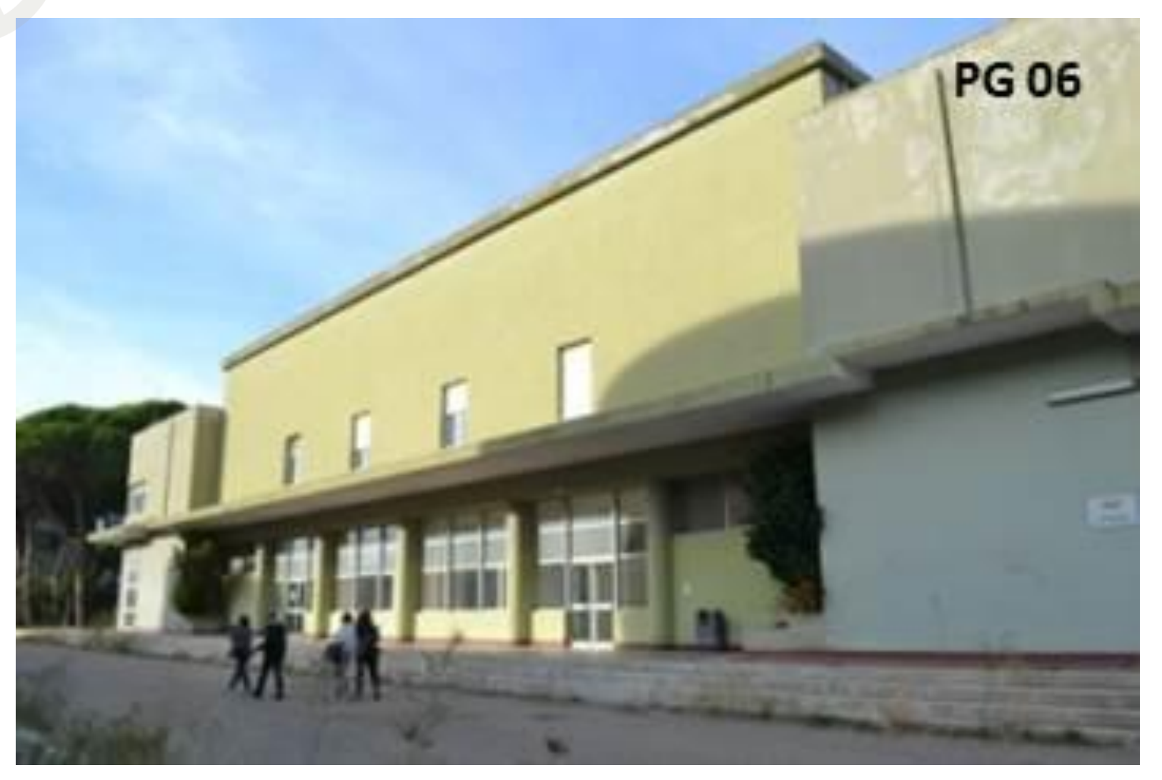
PG06_Troop canteen – Food storage - 205° dold– cinema (F.13, part. 100)