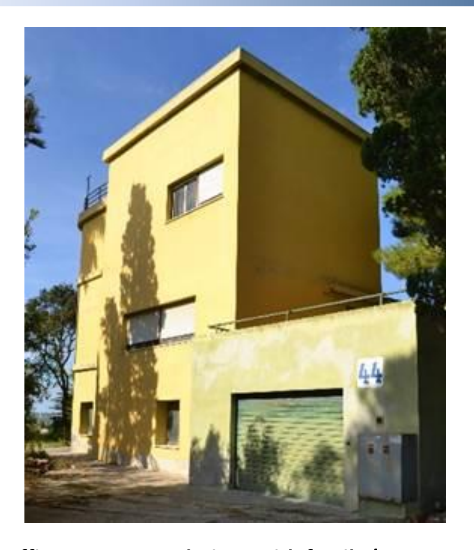
PG44_Officers accommodations with family (F.13, part. 85)