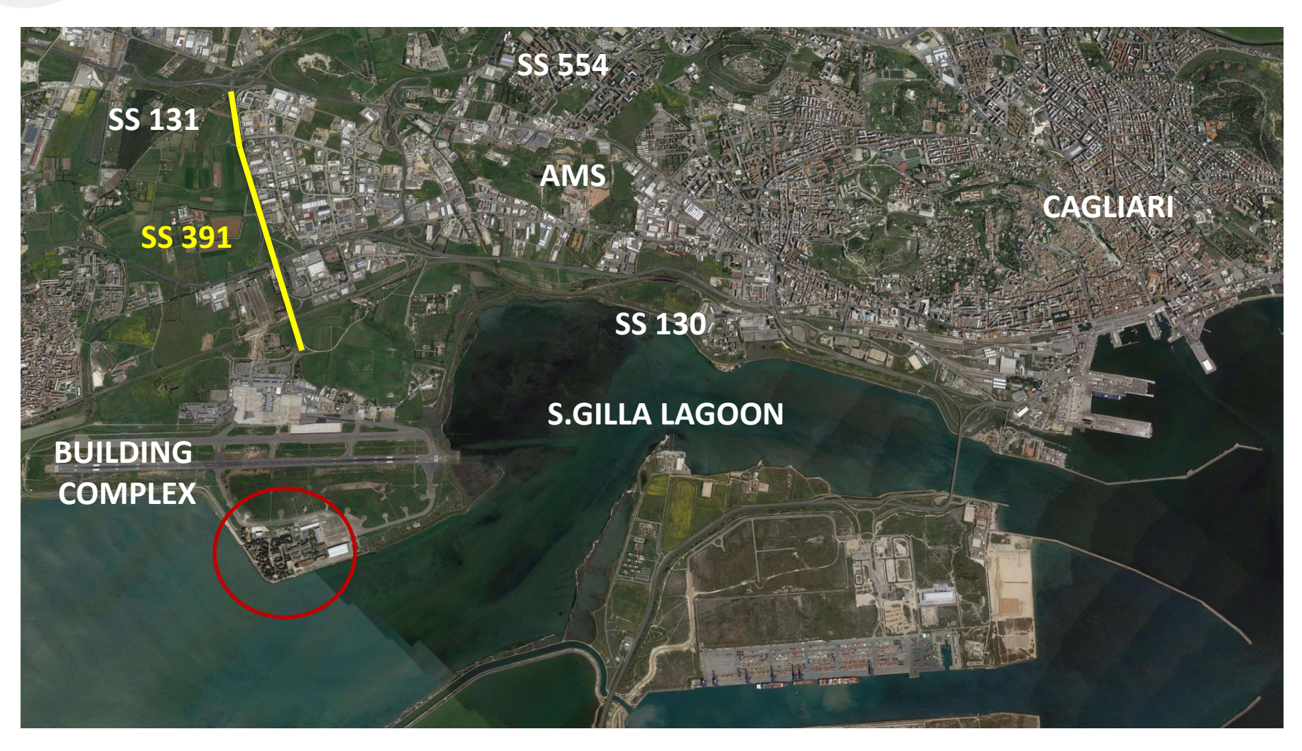
Territorial framework and primary road network