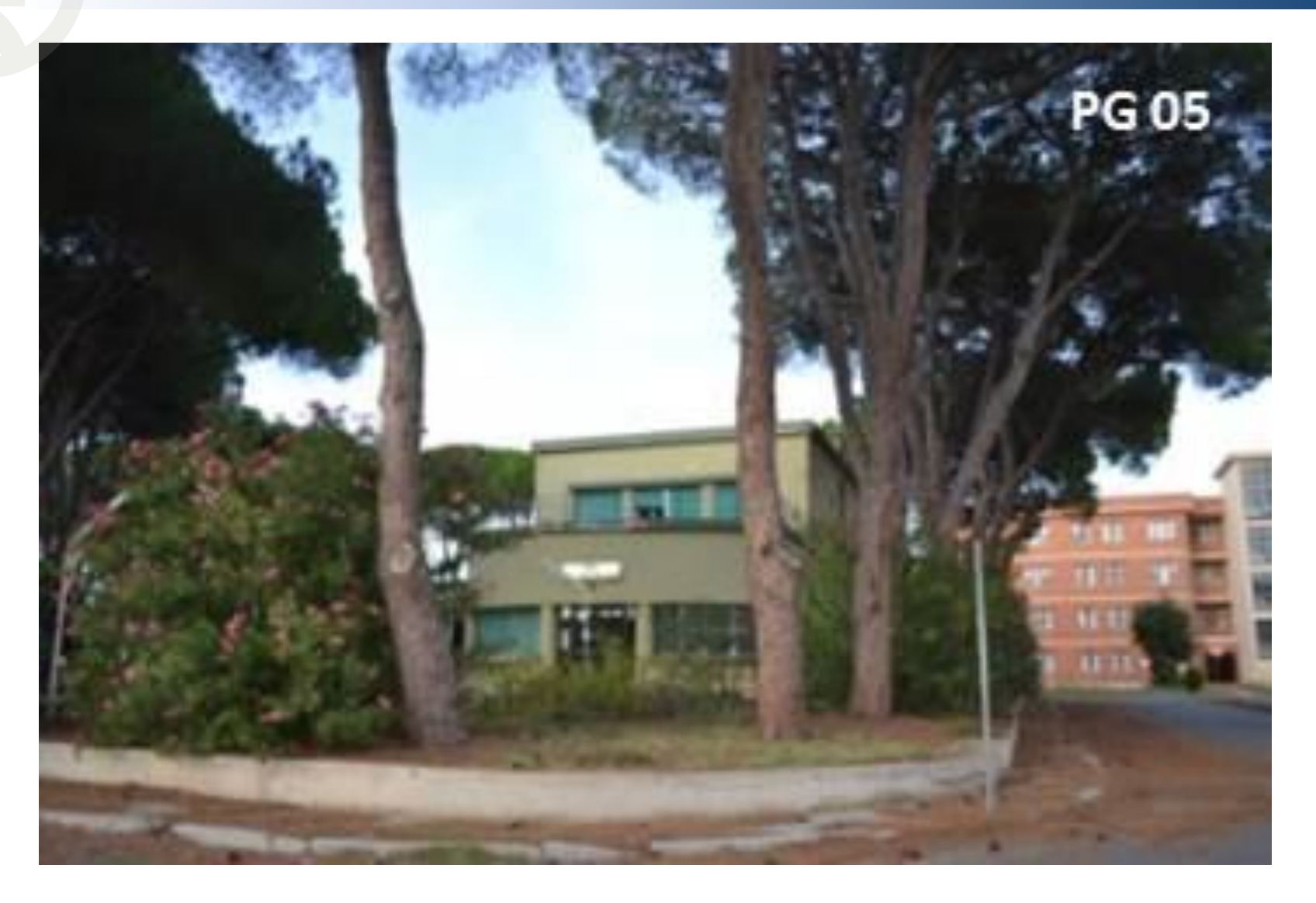
PG05_Troop conference hall (F.13, part. 99)