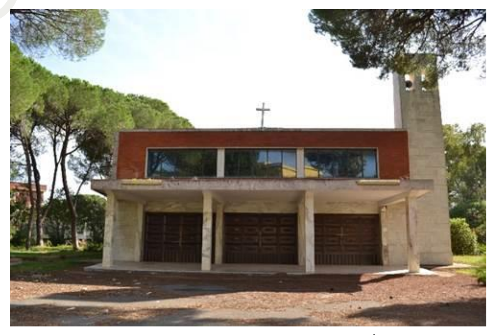
PG79_Airport Church dedicated to the Madonna of Loreto (F.13, part. 86)