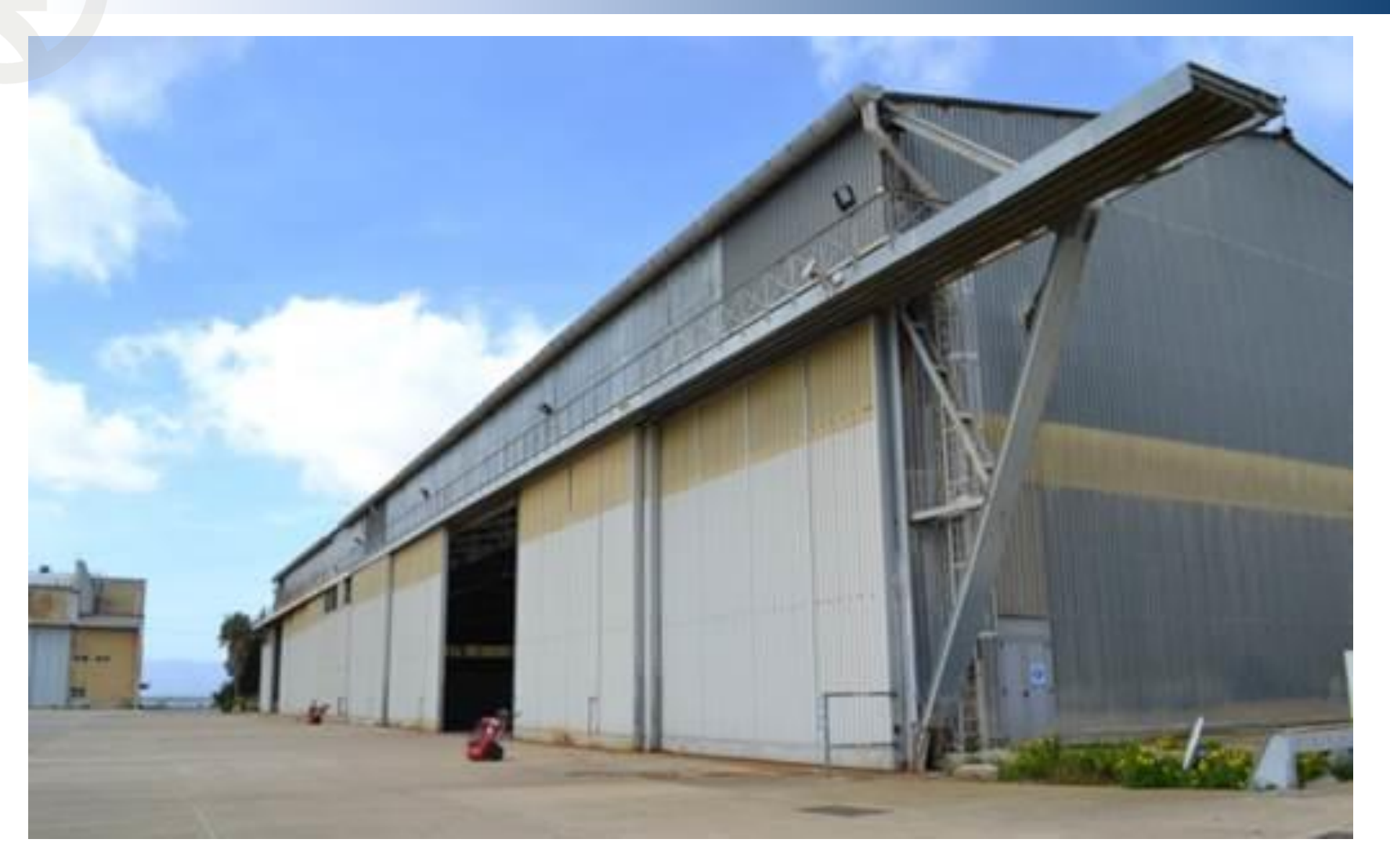
PG22_Hangar S.100 (F.13, part. 118)