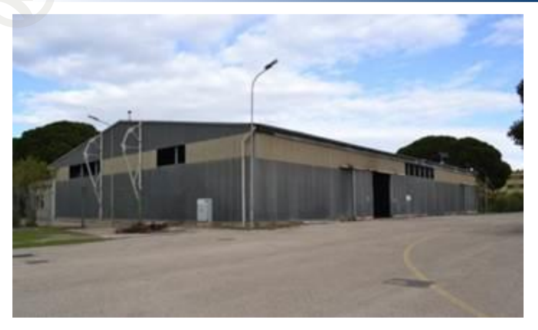
PG14_Hangar S.52 (F.13, part. 87)