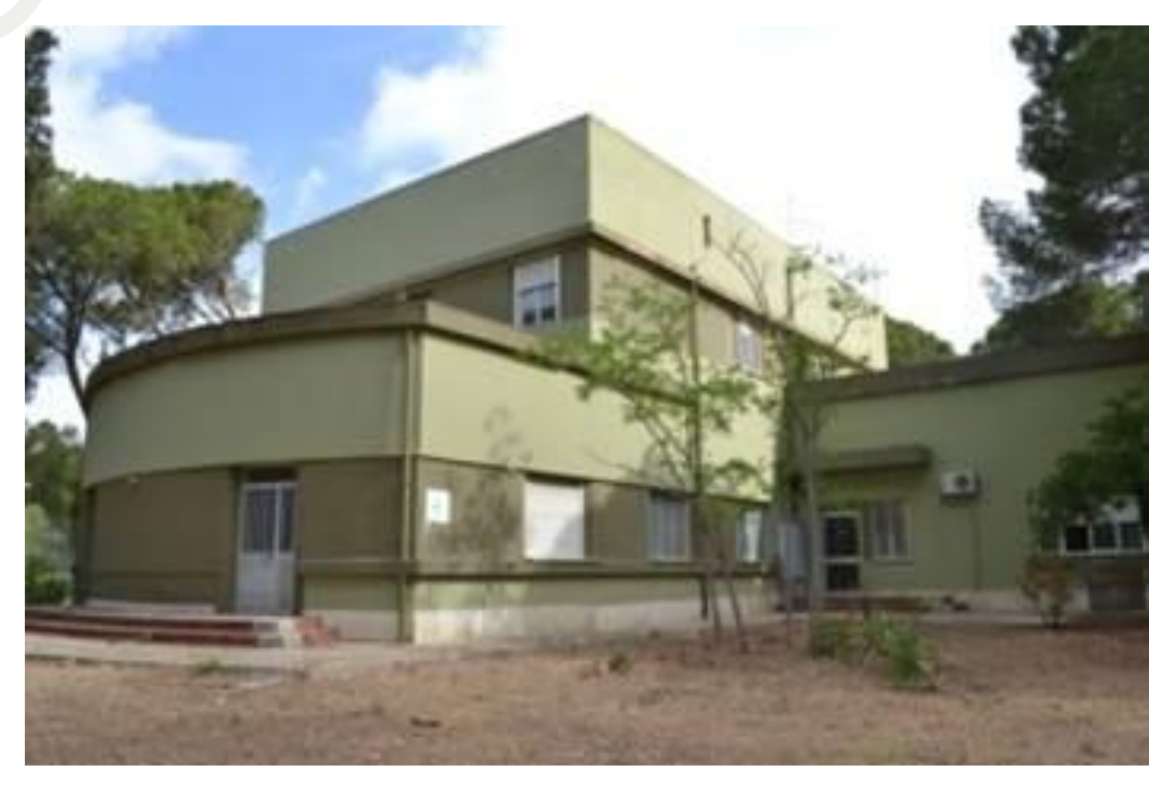
PG04_Airport infirmary (F.13, part. 79)