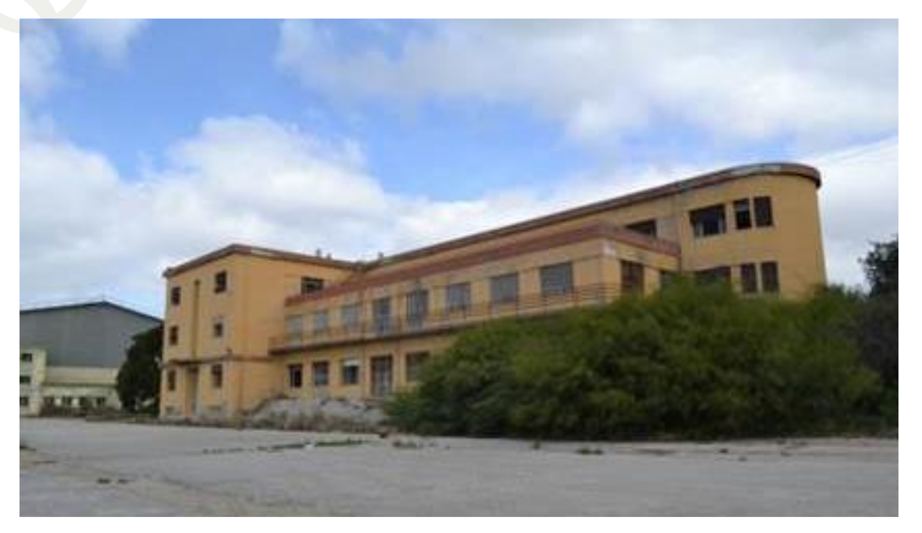
PG19_Weather and TLC Management Room (F.13, part. 120)