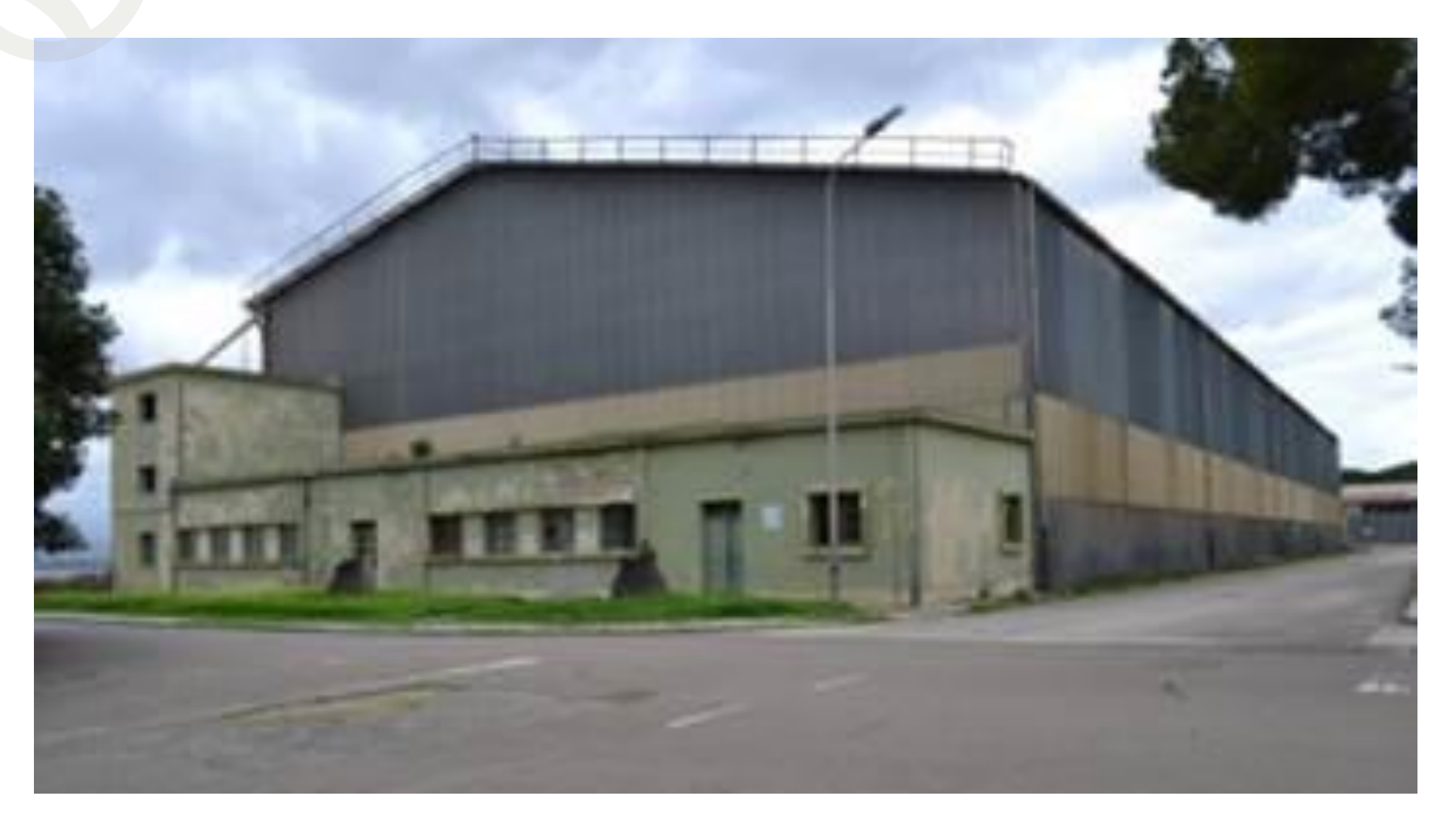
PG15_Hangar S.100 (F.13, part. 90)