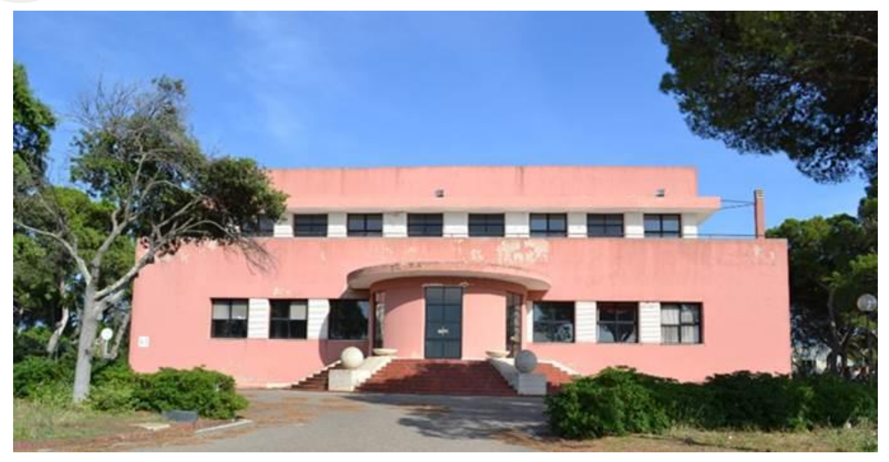
PG41_Club and officers canteen (F.13, part. 124; F.1 Cagliari part. 85)